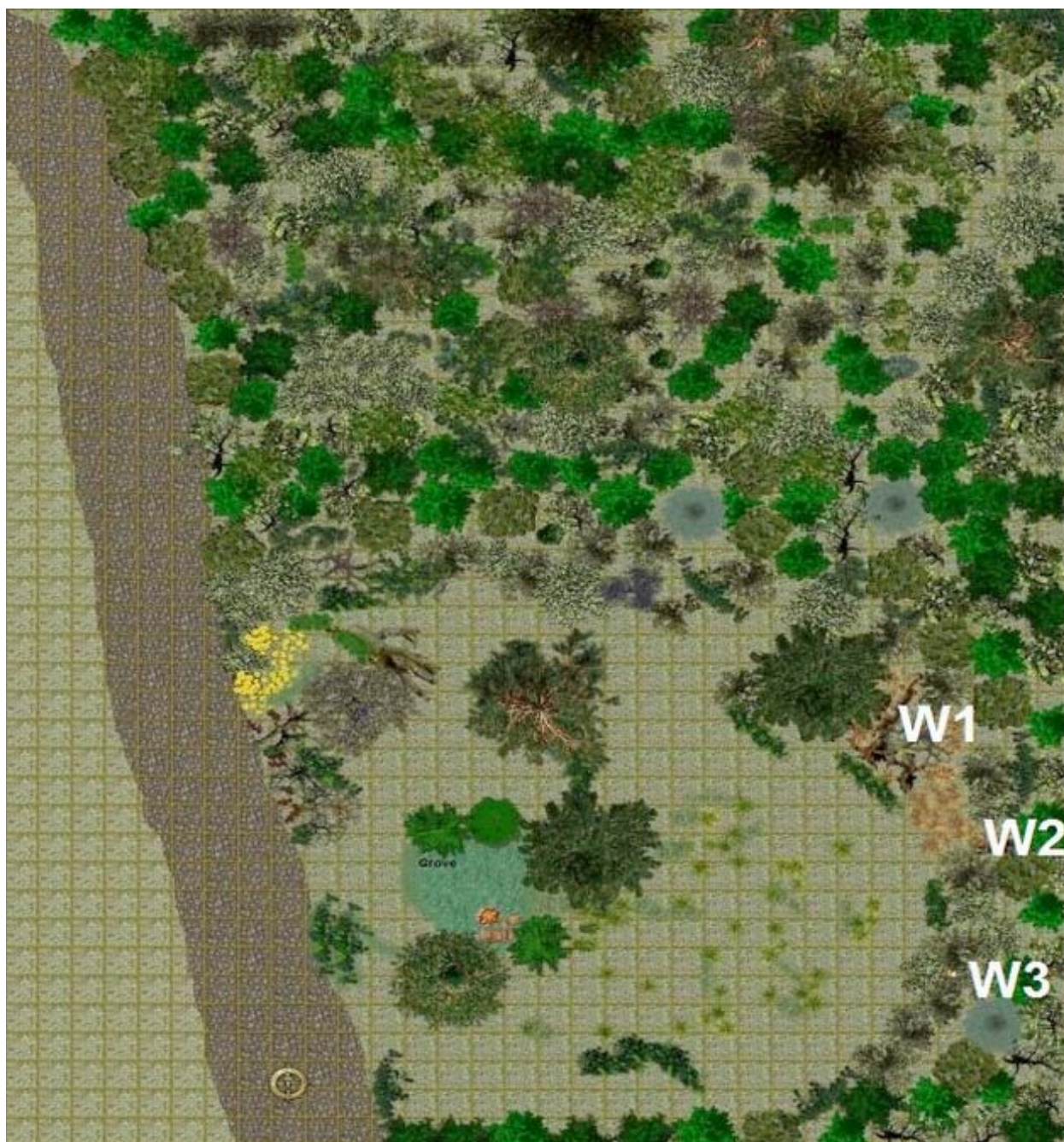
A Meal Interrupted